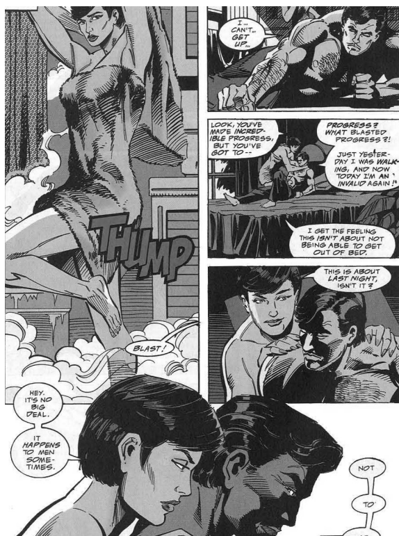
Fig. 8: Questionable virility ( Iron Man 301, 1994).

Furthermore, Stark again and again gets targeted by gendered slurs or has villains and other characters belittle his masculinity, 73 be it his father's "sissy", some other boys' "pansy" ( Iron Man 287) or villains threatening "a guy like" Stark with castration ( Avengers , vol. 4, issue 12, 2011) or, in one particularly graphic case, having Stark kneel before them, "beg" and call them "master" while Stark has to kiss one of the villain's artificial, tentacle-like limbs (fig. 9). 74