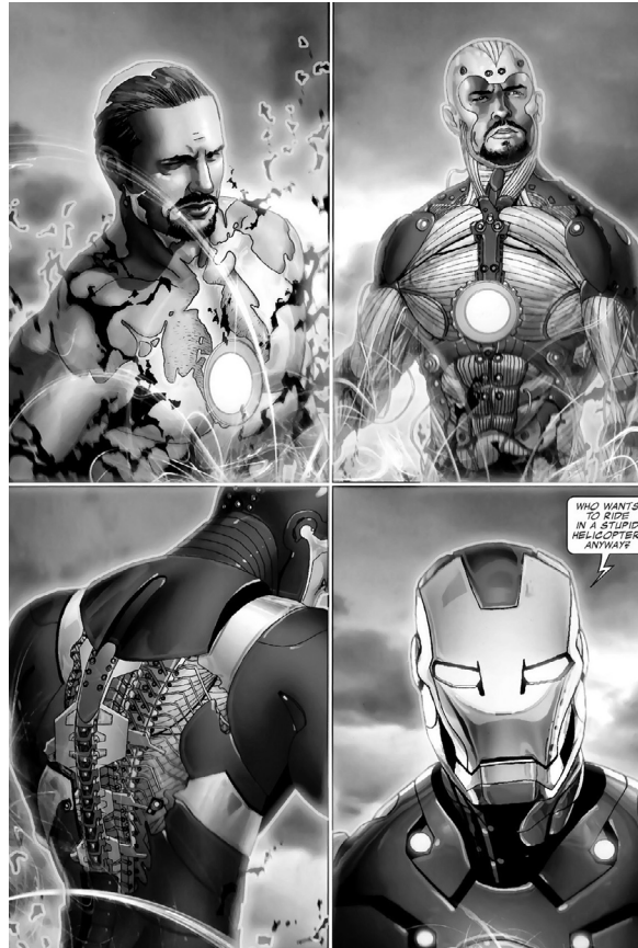
Fig. 2: Bleeding Edge ( The Invincible Iron Man , vol. 5, issue 25, 2010)

Extremis is a 'nanotechnology serum' that directly interfaces with the brain; Stark reprograms it for his own purposes, in the next few years more or less carrying his Iron Man technology in his head and his bones. With Extremis, Stark finally becomes a superhero in the more conventional sense that he does not solely rely on objects exterior to him. The nanovirus gives him superhuman healing abilities, direct access to all information networks, the ability to control the suit "by thought" and so on ( The Invincible Iron Man , vol. 4, issue 5, 2006). This storyline is still one of the prime examples of Stark becoming one with his technology, 14 of a fusion of the suit and the man that will be discussed further down. 15 This fusion lends the visual depiction of the 'metal' the suit is made of a strangely fluid and anthropomorphic quality that is even more heightened in the next model Stark wears, the so-called Bleeding Edge armour (figs. 1-2).