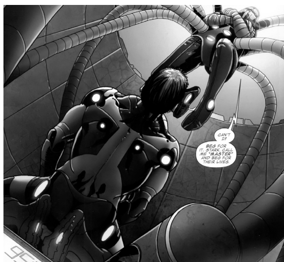
Fig. 9: Invincible Iron Man 503, 2008.

Furthermore, Stark again and again gets targeted by gendered slurs or has villains and other characters belittle his masculinity, 73 be it his father's "sissy", some other boys' "pansy" ( Iron Man 287) or villains threatening "a guy like" Stark with castration ( Avengers , vol. 4, issue 12, 2011) or, in one particularly graphic case, having Stark kneel before them, "beg" and call them "master" while Stark has to kiss one of the villain's artificial, tentacle-like limbs (fig. 9). 74