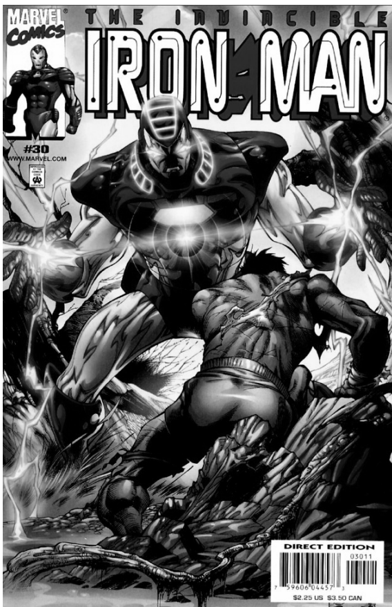
Fig. 10: Machine and Man ( Iron Man , vol. 3, issue 30, 2000).

If the suit is an Ego ideal or compensatory device surpassing Stark in manliness, it is just as much an evil doppelganger of Stark reminiscent of Doctor Jekyll and Mr. Hyde; lastly, it is both an object and a subject of desire and a fetish. A storyline published in 2000 under the title The Mask in the Iron Man blends all those elements ( Iron Man , vol. 3, issue 26-30). In an accident, the newest iteration of Stark's suit gains sentience, only to immediately fall in love with its creator. This love is unrequited, creating a tension in the relationship between the creator, the subject, and his object. The suit, whose gendering is ambivalent, locks Stark into his own house, drives away his girlfriend and asks Stark to love it back. When Stark tries to escape in an older model of the suit, the sentient armour discovers him. A brutal fight takes place, during which the sentient armour utterly dominates Stark and part by part pulls the older suit off him while roaring in jealousy: "how dare you?! You betrayed me! [...] You and that thing!" ( Iron Man , vol. 3, issue 29, 2000; emphasis in original), all the while demanding that Stark get inside it. The sexual symbolism of the scene is more than obvious and places Stark in a position that is hardly typical for a hyper manly superhero (fig. 10).