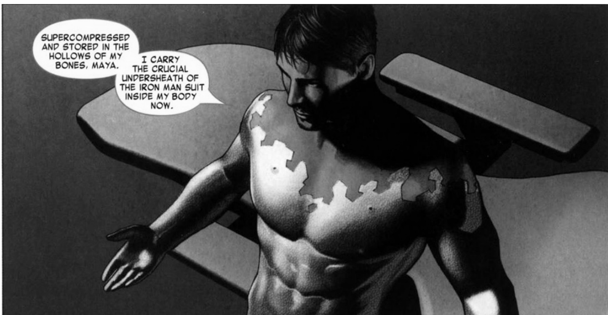
Fig. 1: Metal or Skin? Extremis ( Iron Man , vol. 4, issue 5, 2006)