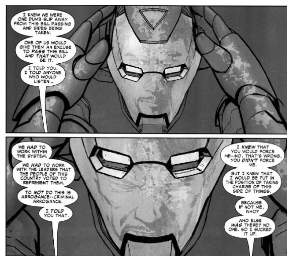
Fig. 4: Civil War: The Confession , 2007.