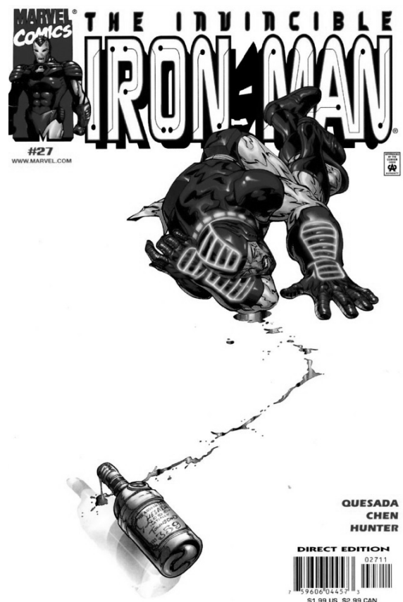
Fig. 7: Tony Stark, the alcoholic ( Iron Man , vol. 3, issue 27, 2000).

1994). Tony Stark is precisely not a man made of iron, 69 a failure his father reproached him for already at a young age ("be a man !"; Iron Man 300; emphasis in original 70 ): "Sometimes I wonder which is the real me... This splendid metal skin I've created – or the frail thing of flesh that wears it" ( Iron Man 164, 1982). From his early appearances in comics, the very vincible 71 Stark again and again appears on panel crying. In the late Seventies, Stark's alcoholism – either caused by or coinciding with depression 72 – adds to that aura of vulnerability. The addiction is often imagined as a contrast between the strong superhero, The Invincible Iron Man , and the weak man Stark (fig. 7).