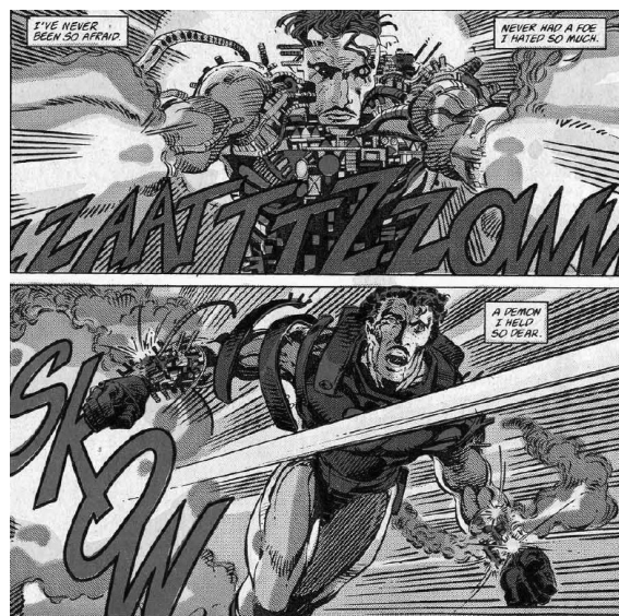
Fig. 6: The grotesque cyborg: Tony Stark’s ‘intimate enemy’ (Iron Man 232, 1988).

The technological body in Iron Man comics carries in it the potential to become grotesque. Stark harbours a constant fear of transforming into a grotesque cyborg 54 that does not seem to conserve any of the positive, liberating connotations Donna Haraway famously developed in the Cyborg Manifesto (1985). 55 In this context the comics feature some visually striking images of a Stark enslaved by a machine (fig. 6) or of dystopian futures in which “the machine” enslaves humanity. 56