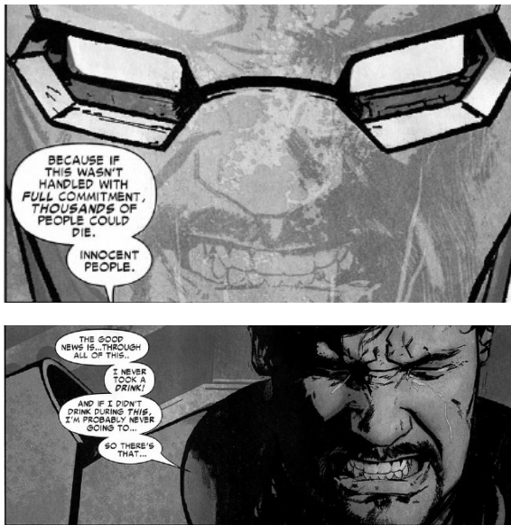
Fig. 4: Civil War: The Confession , 2007.

The mask as part of the armour is a first object whose metaphorical dimensions are central to Stark's problematic or tragic brand of heroism. Certain other metaphorical aspects of the 'iron' suit as a whole are quite obvious and have again and again been taken up over the years. On the manifest level of the comic narrative, Stark wears his suit because his heart is badly damaged and in constant danger of giving out. Depending on the iteration, Stark in fact trades the mostly external chest plate for an internal artificial heart, for example in the form of the arc reactor from the movies or the RT in the comics. 46 "I have a piece of metal rubbing against my heart", Stark states in his new origin story from the Extremis-storyline, alluding to the name he will choose as a superhero ( The Invincible Iron Man , vol. 4, issue 5, 2006). In that sense, the iron he is named after represents both Stark's greatest strength and weakness, both the hero, Iron Man, and the man with the piece of iron endangering his heart.