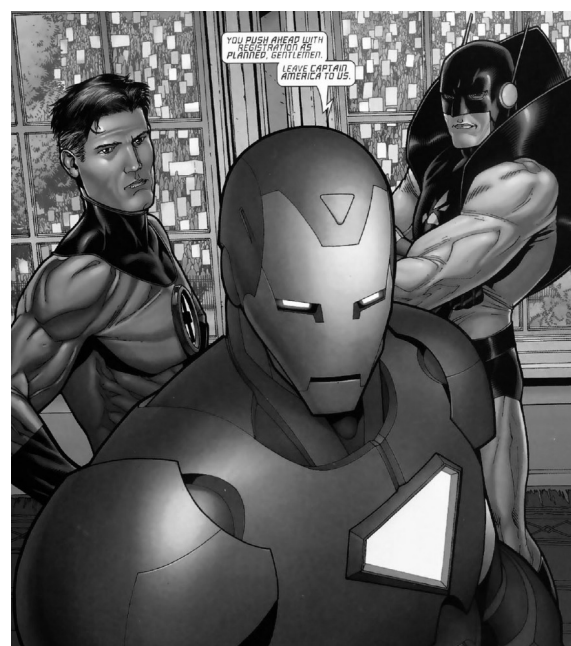
Fig. 3: Civil War 1, 2006.

becomes disharmonious as the face of the man behind the mask begins to twist in emotional agony (fig. 4). In the written narrative, Stark's apparently harsh and more or less remorseless attitude is dismantled as nothing but a show. 45 The intent of The Confession clearly is to establish Stark as a tragic hero who is willing to sacrifice everything for what he considers to be the right thing. Ultimately though, confronted with the shambles of his life and the death of one of his closest friends, Stark has to conclude that "it wasn't worth it": "Even though I said I was willing to go all the way with it... I wasn't " ( Civil War: The Confession ; emphasis in original).