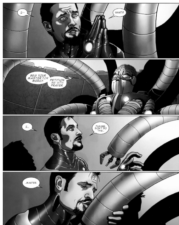
Fig. 9: Invincible Iron Man 503, 2008.

It is quite typical for superhero comics that the protagonists lack an actual sex life. Masculinity is defined by a deficiency: the superhero cannot live a normal life; his superhero identity often comes at the price of love and a family life. 75 In the case of old Iron Man comics this basic structure is heightened by the fact that it is the superheroic identity that infringes upon Stark's attempts at intimacy in a corporeal manner. From the beginning of his publishing history, Stark is described as a charming "playboy" ( Tales of Suspense 39, 1963). Because of his double identity, however, he is never able to more than flirt with beautiful women, as that would expose his chest plate, a fact Genter seems to be unaware of when he sees Stark's "sexuality" as "unregulated" and claims that in creating Tony Stark, Stan Lee rethought the "contours of male identity" according to the model of masculinity developed on the pages of the Playboy magazine. 76 The first such incident already happens the second time Stark appears in comics ( Tales of Suspense 40, 1963). In this instance, the sexual significance of the scene is still implicit, as Stark only declares he cannot go "swimming" with some "beautiful women" because "can never appear anywhere bare-chested". 77 In the form of the chest plate, the hyper manly Iron Man disrupts Stark's love life.