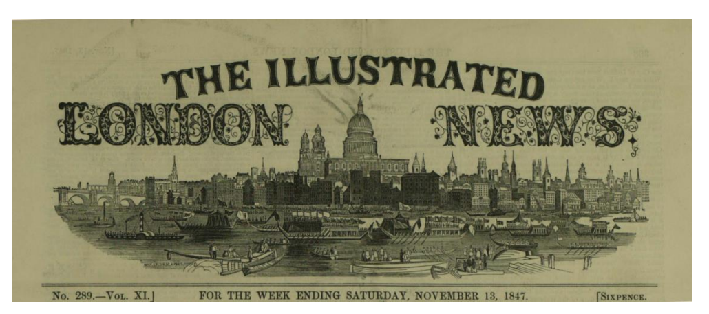
Figure 3 Masthead of Illustrated London News